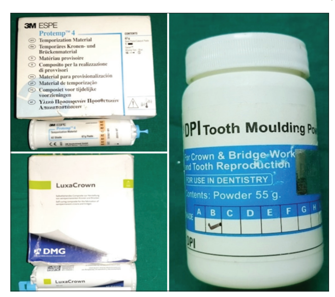
Figure 2: Provisional restorative materials (Protemp 4, LuxaCrown, and Heat Cure polymethyl methacrylate)